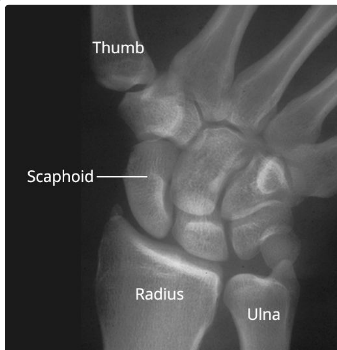
An unrecognized fracture of the scaphoid bone may be mistaken for a wrist sprain.

It is important for your doctor to evaluate even a mild wrist injury if it does not improve quickly. This is especially important if the injury causes persistent wrist pain. Proper diagnosis and treatment of wrist injuries is necessary to avoid long-term problems, including chronic pain, stiffness, and arthritis.